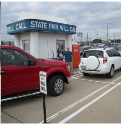
PARK BESIDE WILL CALL BOOTH