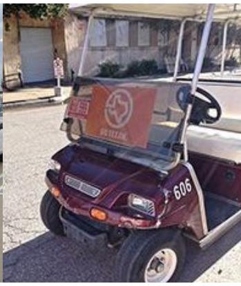
PHONE TDA SHUTTLE

STATE FAIR MAP: The official State Fair driving directions can be found here: