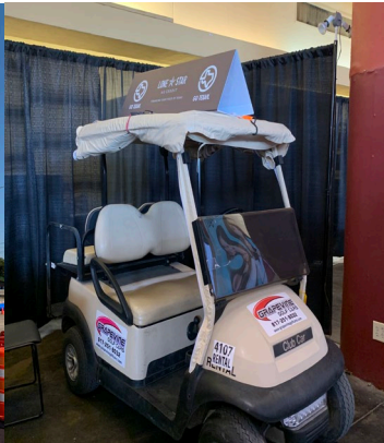
PHONE TDA SHUTTLE