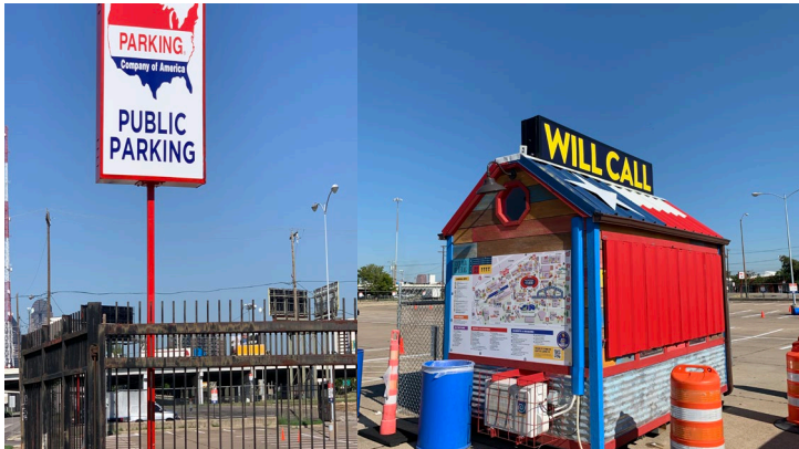
WILL CALL BOOTH